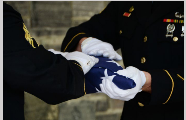
New York National Guard soldiers fold the flag during a 2018 funeral service in Saratoga Springs, N.Y.

Let's take this step by step to explain Reserve Component-Survivor Benefit Plan (RCSBP) eligibility. If you can find your loved one's notice of eligibility letter (20-year letter), it will outline what was selected at the 20-year mark in your spouse's career. If the "immediate" annuity was selected, it is known as Option C (DD2656-5) and you are immediately entitled to your spouse's RCSBP. Option B is a deferred annuity; the annuity is deferred to your spouse's eligible age of 60 if he or she were alive today. Option A is when one declines election and the surviving spouse will not have any RCSBP.